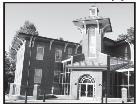
CAES Johnson Horsefall Building in New Haven.

The founding department of the ... Continued on page 2